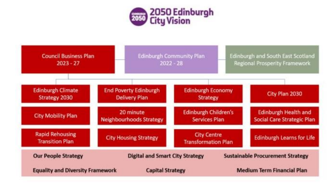
Exhibit 2 City of Edinburgh Council's 2050 City Vision delivery plans